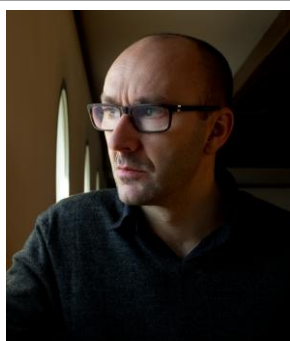
Pedro Rosa Mendes Fiction, non-fiction (Portugal)

Twice the recipient of the Portuguese Pen Club Prize for Best Fiction (2000, 2010), Pedro Rosa Mendes was the Paris bureau chief for the Portuguese News Agency. He is now with the EHESS, with a project about the relations of the former USSR with African new independent states. His work was featured in a German-published anthology of 2000 years of reportage.